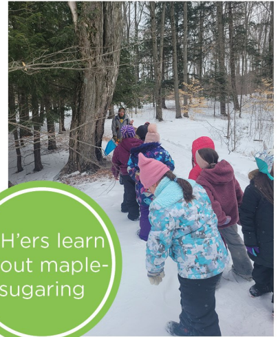
4-H'ers learn about maple-sugaring